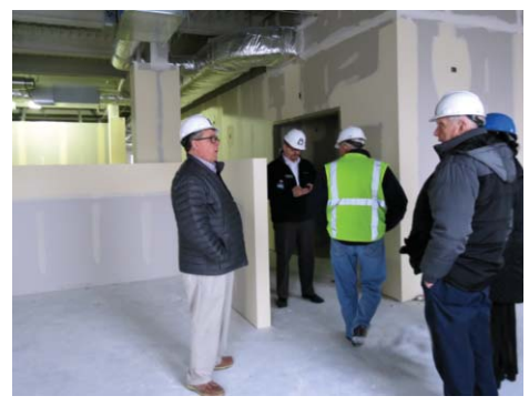
Second floor ready for paint.