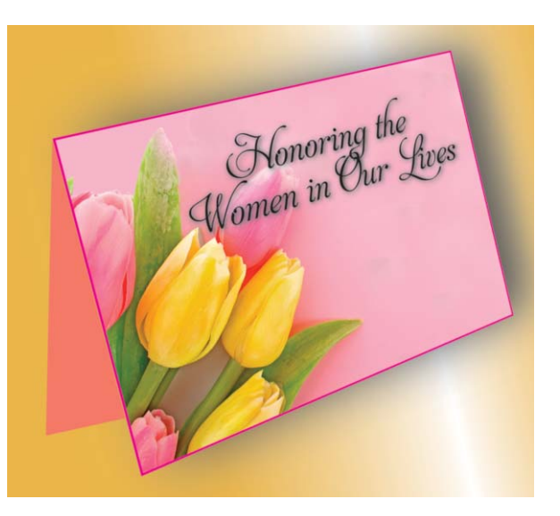
INSIDE: " A GIFT IN YOUR HONOR HAS BEEN GIVEN TO THE FAMILIES OF LIFESPRING MINISTRY, AURORA, IL."