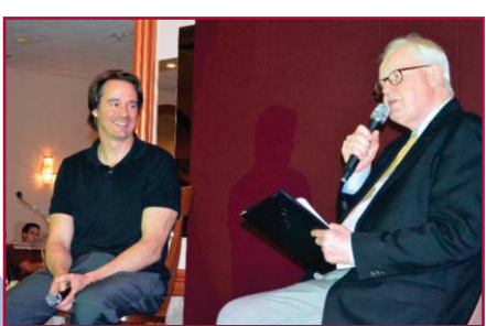
Master's Touch 2013 Banquet