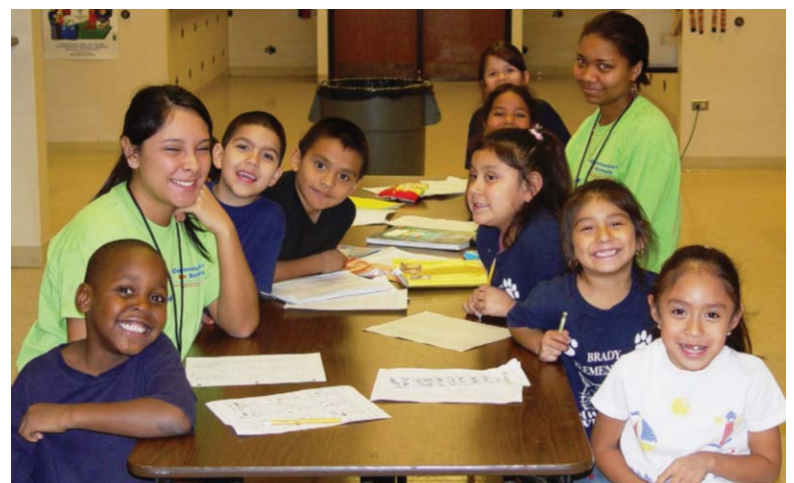
Kids engage in positive interaction among youth of various races and culture.

have been entered into with local Aurora orgnizations Communities in Schools (CIS) and