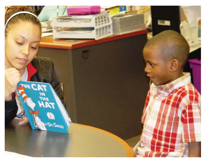
Kids are offered opportunities and avenues to realize their full God-given potential through educational, recreational, and spiritual programs thus empowering them to become tomorrow's urban leaders.